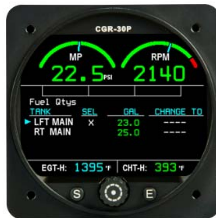
Fuel Qtys Screen